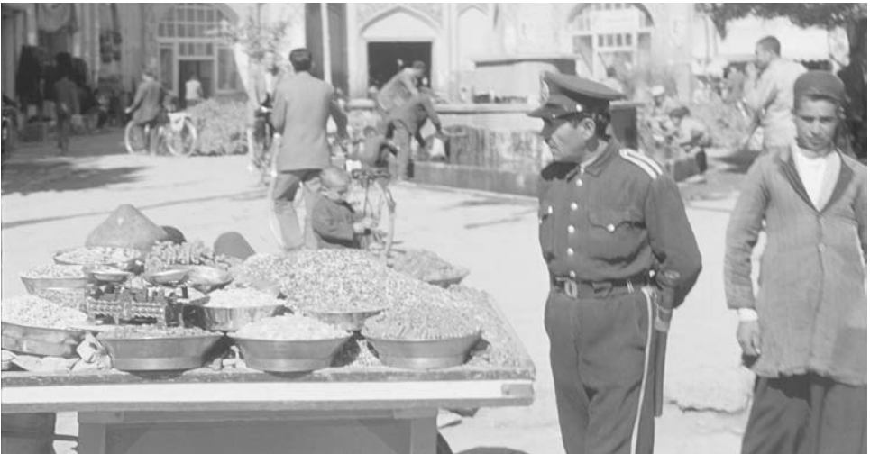
A nut and sweet stand near the central bazaar in Isfahan, Iran. Nuts and fruits are important ingredients in many Iranian dishes and as snacks.

There is a tradition of treating yourself to an early (four or five o'clock in the morning) breakfast after a night out or in anticipation of a day of hard work in cold weather. Typically, the meal consists of either of a hearty broth made from the feet, head, and tripe of lamb cooked slowly overnight with onions and garlic ( kaleh pacheh ), or a slightly sweet porridge made out of wheat and lamb cooked together, pounded well then simmered over a low heat, and stirred continuously for several hours ( haleem ). Both are cooked in a specialist shop— kaleh pazi for the former and haleem pazi for the latter. Kaleh pazis usually have a few tables and chairs for those who would like to eat in, but most clients prefer to take the food home. It is eaten with freshly baked flatbread ( sangak ) and pickles. Haleem pazis do not offer seating facilities, and haleem is bought and taken home to eat with fresh bread, a generous sprinkling of cinnamon and a knob of butter.